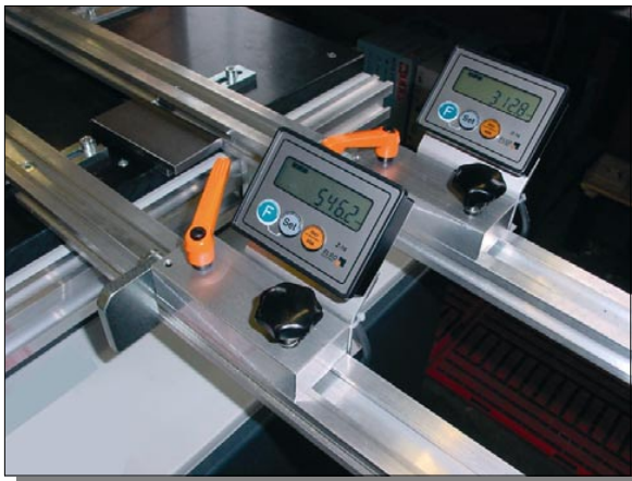
Z16 Example for an application "manual stop system"

Z15/16/17 are especially suited for installation on moving slides stop- and gauge systems.